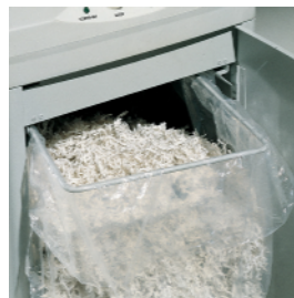
Front door for easy emptying of collecting bag

* Capacity may vary on power supply, paper quality and lubrication of cutting knives