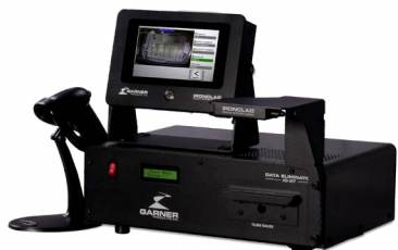
IRONCLAD Erasure Verification System