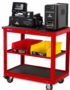
Data Eliminator Cart Package (RCC-25SSD IRONCLAD with optional bins)

Our cases and carts are designed to give you field mobility in every type of situation from the office to the battlefield. Our workstation table is lightweight and features a locking cabinet for storing media.