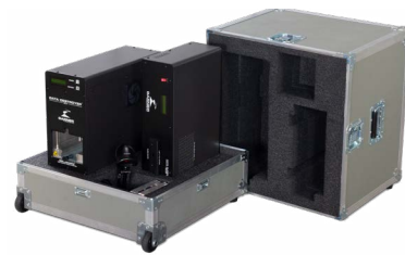
Degauss, Destroy Mobility Package (DDM-25SSD)