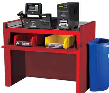
Degauss, Destroy, Recycle Workstation package (DDR-25SSD IRONCLAD)