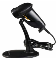
SCAN-1X Media destruction software and scanner