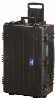
CASE-HD2XIC MIL SPEC Shipping Case