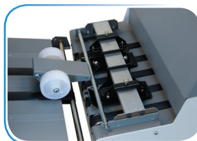
Guide wheels and six-ball-roller deck ensure forms enter the stacker smoothly