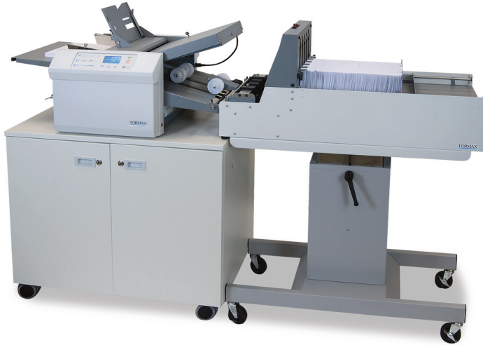
FD 38X Document Feeder and V-Stack36 Vertical Stacker, shown with optional V-Stack36-10 Adjustable Stand and cabinet.

Note: Stand is not required for use with Formax tabletop models. The V-Stack36 infeed is designed to align with the folder's outfeed on a tabletop or cabinet.