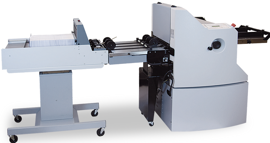
FD 2094 Pressure Sealer, in-line with V-Stack36 Vertical Stacker and V-Stack36-10 Adjustable Stand.

Note: Stand is not required for use with Formax tabletop models. The V-Stack36 infeed is designed to align with the sealer's outfeed on a tabletop or cabinet.