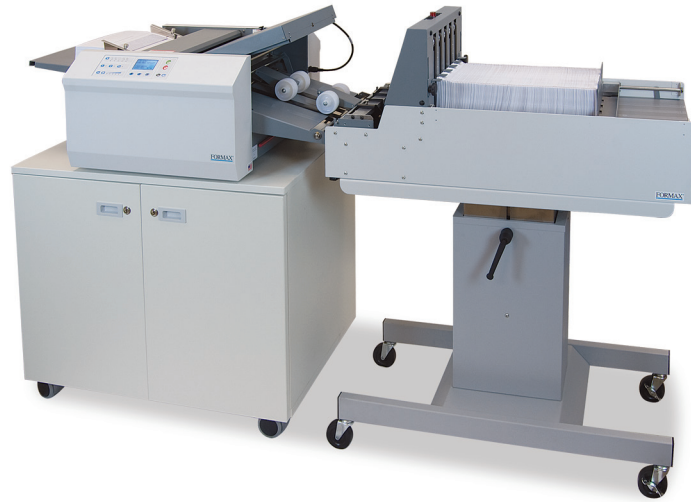
FD 2054 Pressure Sealer and V-Stack36 Vertical Stacker, shown with optional V-Stack36-10 Adjustable Stand and cabinet.

Note: Stand is not required for use with Formax tabletop models. The V-Stack36 infeed is designed to align with the sealer's outfeed on a tabletop or cabinet.