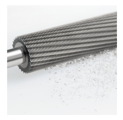
SOLID STEEL CUTTING SHAFTS High grade, hardened steel cutting shafts are milled in our Balingen factory and warranted for life.<sup>1</sup>