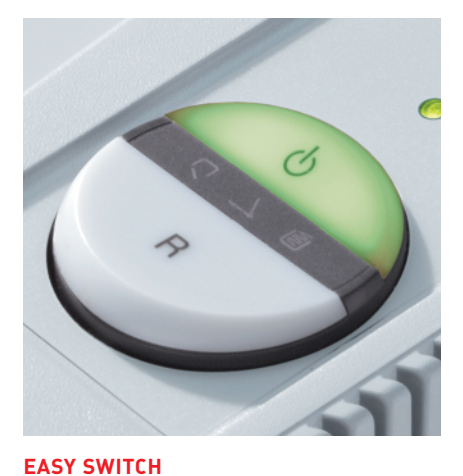
Multifunction control element uses optical signals to indicate operational status and functions as an emergency stop switch.