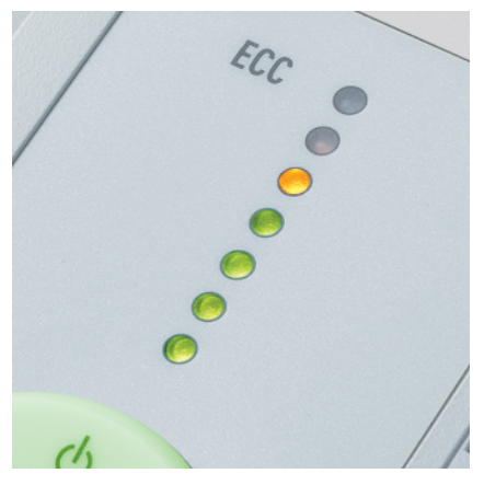
CAPACITY INDICATOR Patented Electronic Capacity Control (ECC) indicator monitors sheet capacity levels during operation to prevent jams.