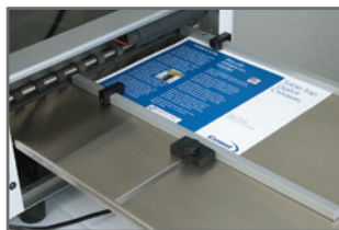
One Step Feed