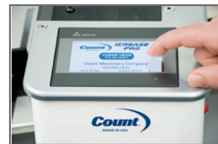
Touch Screen Controller

The COUNT™ iCrease Pro is a simple yet robust solution for creasing of digital media to eliminate cracking when folding. The iCrease Pro gives you all of the automation of bigger COUNT machines in a simple hand-feed machine anyone can use.