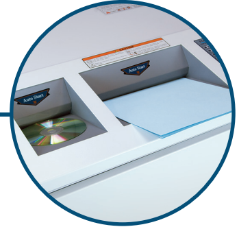
Dedicated Systems Separate infeeds and waste bins for paper and optical media