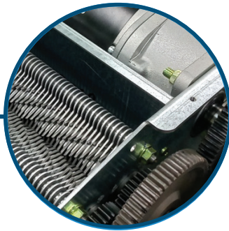
Commercial Grade Heat-treated solid steel cutting blades, all metal gears, & an AC geared motor