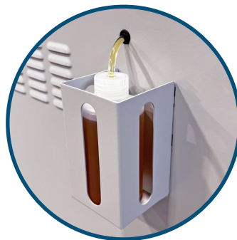
Automatic Oiling System EvenFlow™ Automatic Oiling System lubricates blades for peak performance