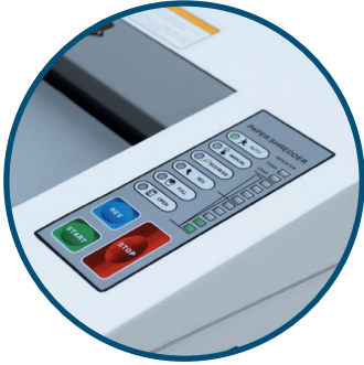
User-friendly Control Panel Auto Start/Stop/Reverse, Full Bin Indicator, Load Indicator

The AABES AB800 is EPL Listed , meeting the requirements of NSA/CSS Specifications 02-01 and 04-02 for High Security Cross-Cut Paper Shredders and Optical Media Destruction Devices. With dedicated infeeds, it can shred paper, and CDs, DVDs, and Blu-ray discs to 2mm x 2mm or less . Separate waste bins make for easy disposal, and have a lifetime guarantee. Standard features include a user-friendly LED control panel, geared chain-driven cutting heads, and a heavy-duty all-metal cabinet with casters . The EvenFlow™ Automatic Internal Oiling System lubricates the cutting heads automatically for peak performance.